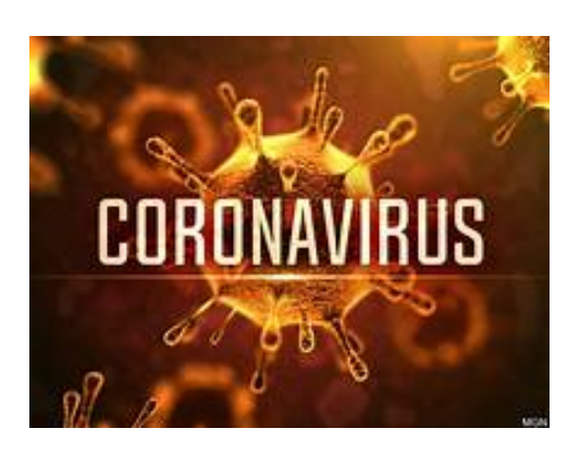
18th March 2020